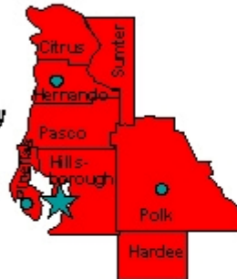
Tampa Bay Region 3

Alachua County Baker County Bradford County Clay County Duval County Flagler County Gilchrist County Levy County Marion County Nassau County Putnam County St. John's County Union County