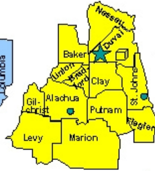
Jacksonville Region 2