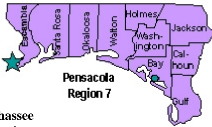
Pensacola Region 7