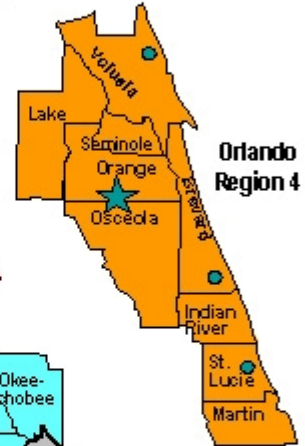
Orlando Region 4

Brevard County Indian River County Lake County Martin County Orange County Osceola County Seminole County St. Lucie County Volusia County